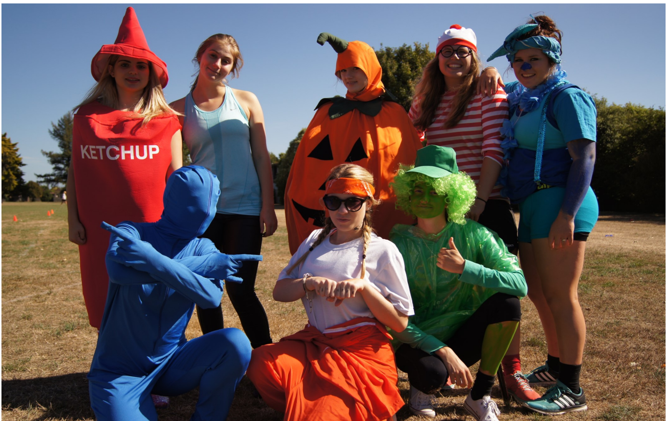
School Athletics 2015

Students may need to catch a taxi to a venue if they have not got any transport. This is booked at team checks at interval on the day that they play. One way, ie to the venue will be $10. If they return by taxi it will be another $10.